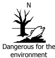
Dangerous for the environment