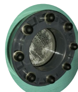
▪ Ø135 mm sightglass