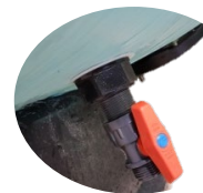
▪ 3/4" water drain