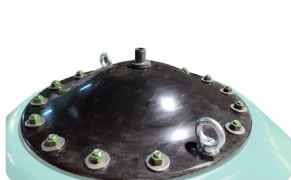
▪ Ø400mm plastic top lid