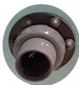
▪ All the connections are assembled with flanges except the Ø63 which comes with racords.