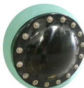
▪ Ø225 or Ø400 mm lateral manhole