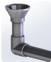
▪ Cone diffuser and internal pipe made of PN-16