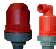
▪ 1" or 2" air relief valve